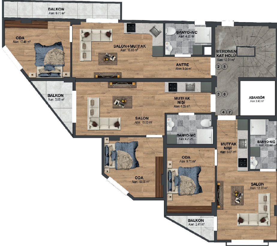
1.VE 2. NORMAL KAT PLANI