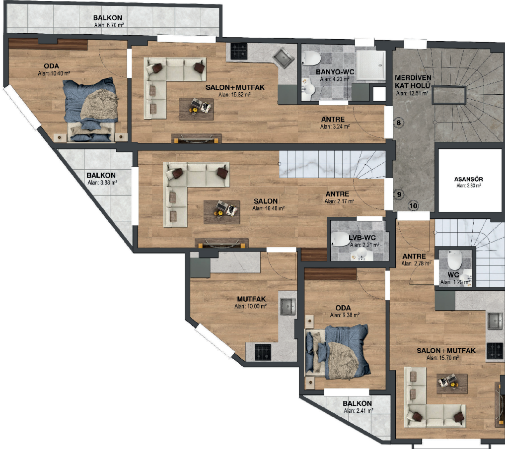
3. NORMAL KAT PLANI