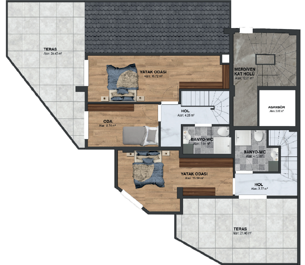
ÇATI KATI PLANI