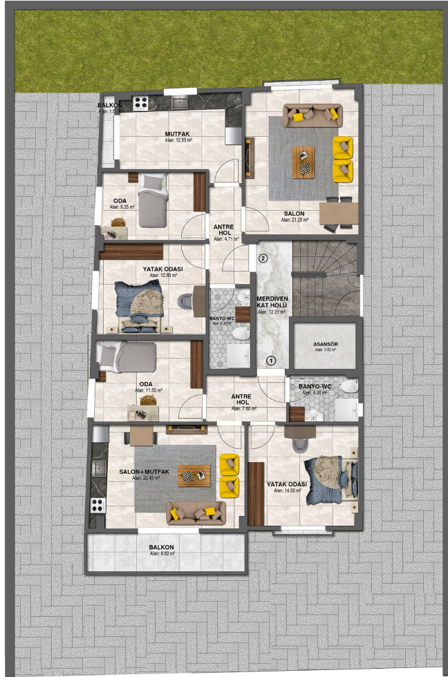
ZEMİN KAT PLANI