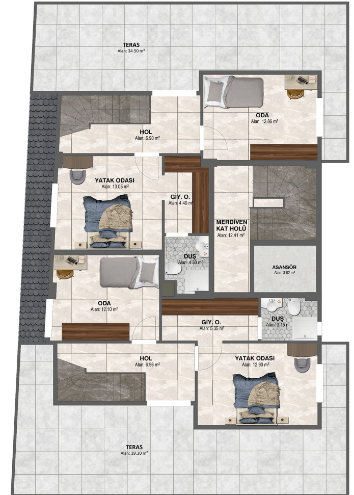
ÇATI KATI PLANI