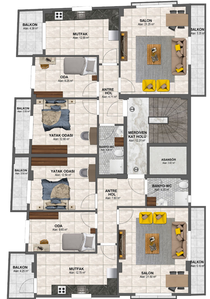
1. VE 2. KAT PLANI